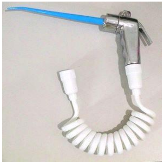
Figure 1. The prototype of the water irrigator

In this study, a prototype of water irrigator was designed and constructed. The water irrigator is faucet powered so that the pressure can be easily controlled by adjusting the tap. It is also a safety feature for the users to prevent any gum injury from excessive pressure of the water stream. The water irrigator is then attach to a long, narrow and angle tip. This feature is important in order to facilitate cleaning especially at the posterior region. It is also to ensure the safe distance between the tip and the tooth.