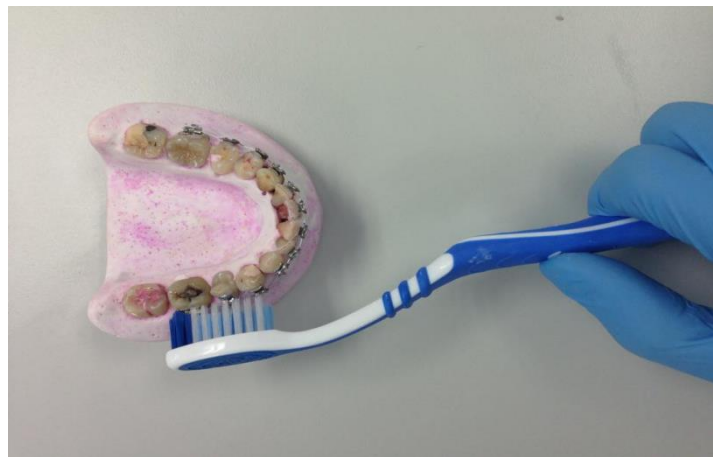
Figure 4. Toothbrush (control group) was used to remove the plaque.