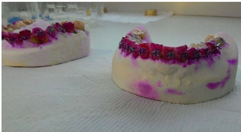
Figure 2. The plaque after been disclosed using disclosing gel

After two days, the plaque was disclosed using disclosing gel and initial plaque score was taken. The presence of plaque was recorded based on Rustogi Modification of Navy Plaque Index (RMNPI). In RMNPI, the labial surface of each tooth was divided into 9 areas and then were score 1 if there is presence of plaque and 0 if there is absence of plaque at each area. Then, the total of the plaque score was sum up for each arch.