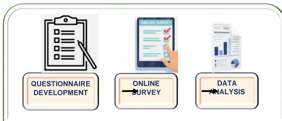
Figure 1. Phases in Methodology

According to the flowchart in Figure 1, there are three phases to achieve the aim of this study. The first phase is questionnaire items development that focuses on the awareness among students towards the use of RPG as an aid tool in teaching and learning. The online survey was distributed to Kolej GENIUS Insan students in the second phase. Finally, the third phase involves data analyses based on the number of students who participated in the survey.