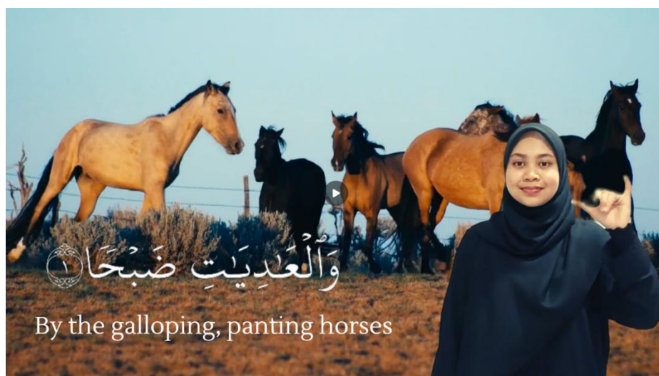
Figure 2: Development of surah Al- 'Adiyat

From this figure the researcher carefully follows the comment in the phase before while also considering the deaf people need as it a pivotal to succeed in achieving the objectives for this research.