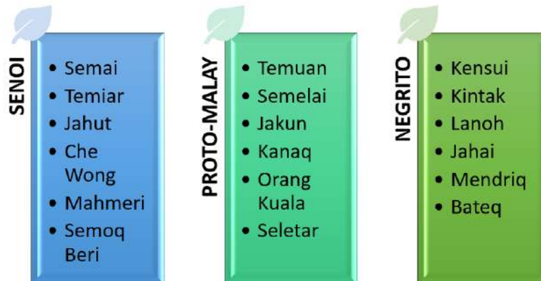
Figure 1.1: The indigenous assemblages in Malaysia (adapted from JAKOA Strategic Plan 2016-2020)

The indigenous community in Malaysia is a part of the multiracial communities, due to the long history of colonialization and migration. Malaysia entails three mainstream clusters namely the Malays, Chinese and Indians, and the indigenous groups are only 0.7% from the total population of Malaysia. The Malaysian government defined indigenous people or known as Orang Asli (original people) as individuals from the Orang Asli lineage that practice the indigenous cultural way of life and communicate using their indigenous languages in Peninsular Malaysia (Department of Orang Asli Development (JAKOA), 2016). There are around 180 000 indigenous people in Malaysia and they are divided into three main assemblages known as the Senoi, Proto-Malay and Negrito. Each major group is made up of smaller tribes such as Temuan, Semai, and Jahai. The complete list of the indigenous tribes is illustrated in Figure 1.1.