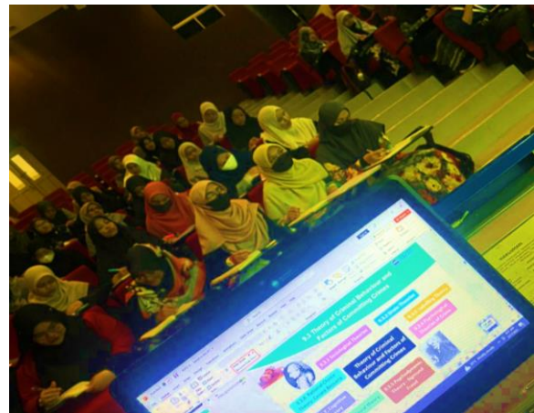
Figure 1: Student TSU batch 2022/2023 learning session.

the Covid 19 than before with lecturers learning new teaching techniques and becoming more innovative. Movie clips from the movie “Joker” (2019) were used as an approach for blended learning to demonstrate theories of criminal behaviour during lectures. After lectures during the class sessions, movie clips were used as an interactive activity to demonstrate student understands of theory and apply it in actual situations.