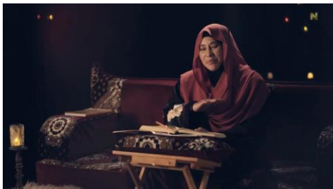
Figure 5.2 Content of "Ahdaf al-Qur'an"

The topic of the identity crisis of a Muslim, makes the public also faced with the reality of the current decline in public ethics and morals, as well as the development of Islam phobia that occurs in various countries through various news of social media and online news.