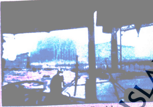
The power station at Chernobyl, the site of the world's worst nuclear accident

Until April 1986, few people outside the Ukraine in Eastern Europe had heard of the town of Chernobyl. Then the nuclear power station there exploded. Clouds of radioactive dust spread over Eastern and Northern Europe. 250 people were killed and thousands of square kilometres were polluted. Even in Britain, more than 2,000 km away, animals were affected by the radioactive dust that fell from the sky.