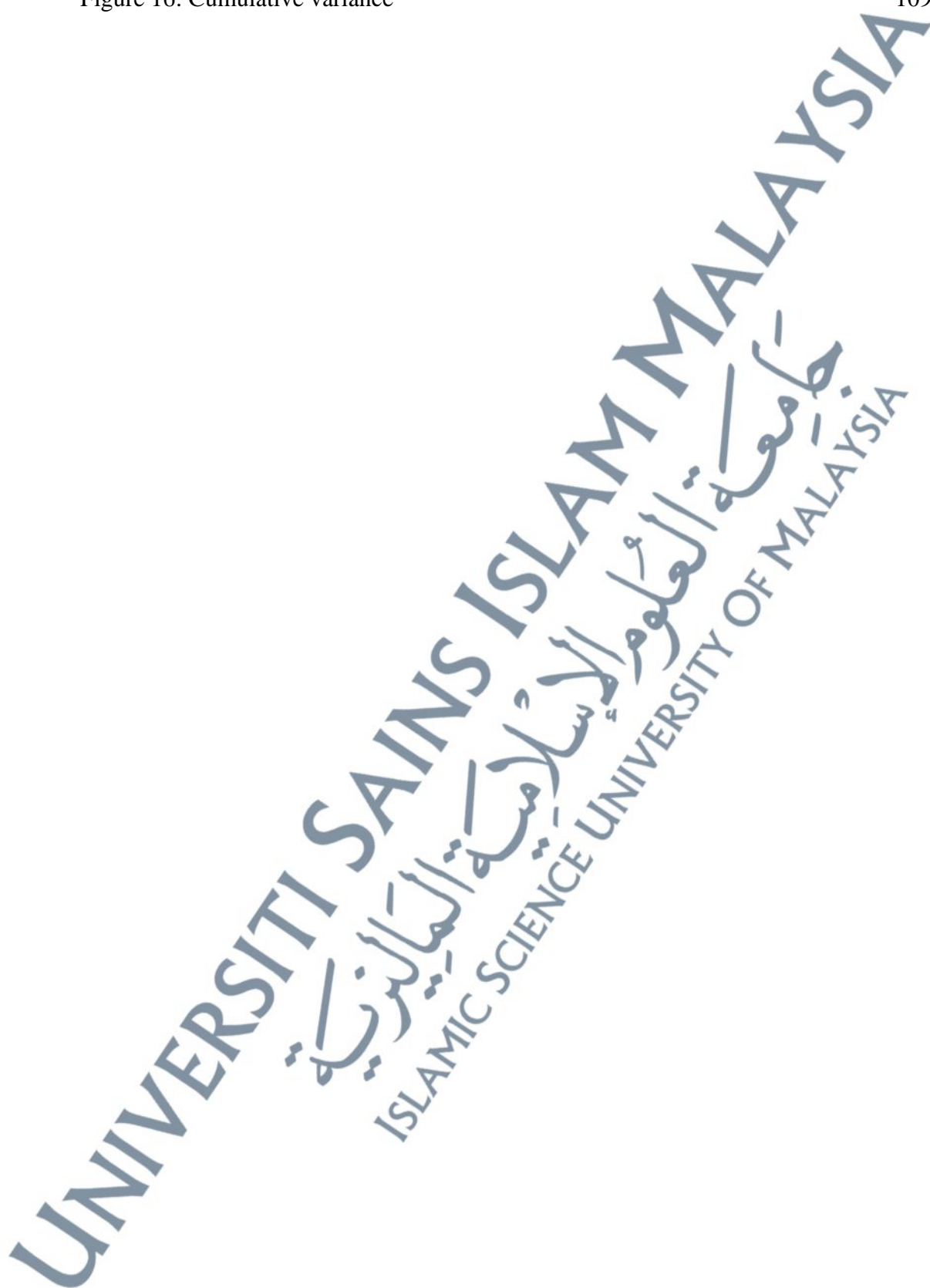
Figure 16: Cumulative variance