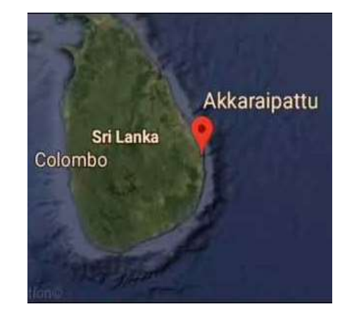
Figure 1: Research area: Akkarapattu,

In the study area, various social welfare organisations are implementing a number of poverty alleviation programmes. These programmes aim to provide access to basic services like education, healthcare, and employment opportunities. Additionally, they strive to build community capacity and provide economic support to the most vulnerable families. Among these programmes, the Samurdhi scheme, funded by the government, and the zakat fund, functioning by charities of the Muslim community, represent two of the most significant programmes implemented within the study area. On the basis of this, the study attempted to determine which of these two schemes plays a significant role in alleviating poverty. The study looked at the effects