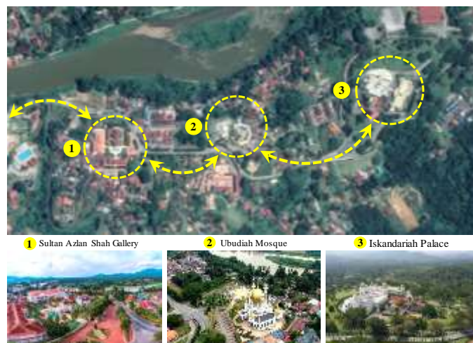
Figure 6: The presence of the palace, mosque and gallery along the winding street (Istana Street) formed a continuous visual chain of markers supporting visual permeability and legibility

with visibility and street recognition in the royal town. Based on observations, for long and winding streets such as Istana Street, the presence of prominent civic buildings such as the Palace, Mosque and Gallery as additional markers at street corners formed a series of road markers that create visible and legible streets. The distinctive architectural style of these civic buildings serves as a visual landmark even in winding streets. The presence of buildings at the street corner acts as a guide to pedestrians about their location on a street. This helps them to visualize where they are even though they are not sure what is ahead of the winding street. This finding demonstrates the presence of civic buildings that highlight its function through the link between its location on the street and its architectural style that stands out from its surroundings. This subsequently formed sequence of markers that makes the street visible and create 'a sense of getting somewhere' to pedestrians. Thus, the relationship between the functioning of the civic buildings, architectural styles that stands out and the appropriateness of its location along the winding streets makes visibility possible. This forms a clear path through the physical appearance of the buildings that stand as markers which help make the street more visible, legible and recognizable.