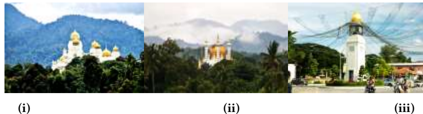
Figure 5: The presence of vertical elements from the tower of Iskandariah Mosque (i) the minaret of Ubudiah Mosque (ii) and the Kuala Kangsar Clock Tower (iii) enhances visibility and acts as a reference point and landmark to the Royal Town