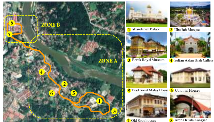
Figure 2: Map showing location of buildings

Results shown in Table 2 indicate that respondents associated attractiveness with several important elements. Firstly, location of the buildings on a hilly area around Chandan Hill (Iskandariah Palace 98.4%, Ubudiah Mosque 90.9%, Perak Royal Museum 84.8%, Sultan Azlan Shah Gallery 77.3%) contributes to the distinctive architectural appearance of the civic buildings. Its location along the Perak River also creates an impressive quality of view from the top down and makes it easily recognizable from afar. Secondly, the function of Iskandariah Palace as the most dominant civic building which serves as the administrative centre for the state of Perak Sultanate and the Ubudiah Mosque as a visual symbol of the presence of Islam emphasize the functionality of these two most prominent civic buildings.