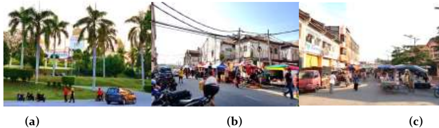
Figure 1: General views of Istana Street (a), Laksamana Street (b) and Shahbandar Street (c)

Streets and Combination Street. This is due to the presence of commercial buildings and mixed-use buildings (old shophouses) along the street, which depict the street as a public space that forms the distinctive image and identity of the royal town. Streets with different typologies (civic street, commercial street and combination street) enriches the results as it encompasses a comprehensive study between the appearance of the buildings and its related street.